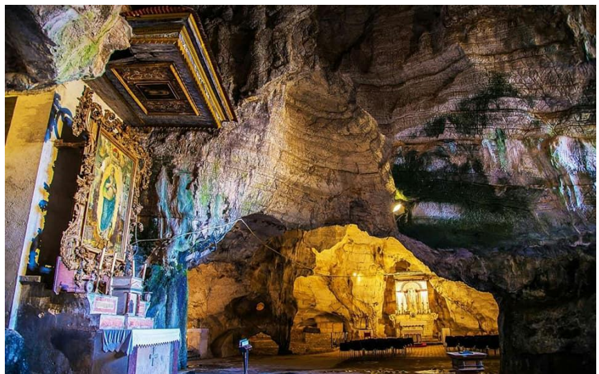
View of the interior