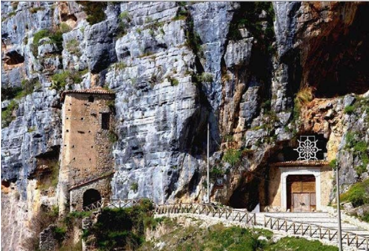
The exterior with bell tower and portal