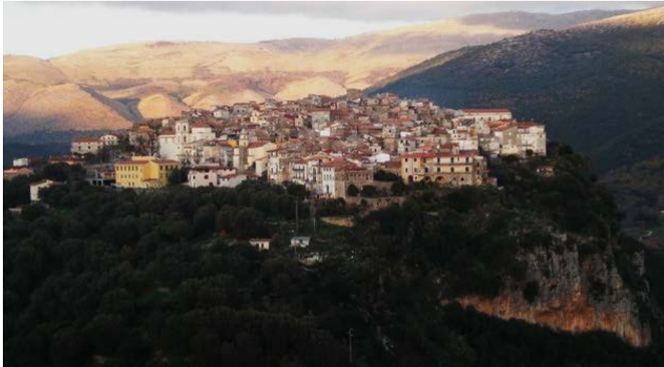
The perched village of Camerota (SA)