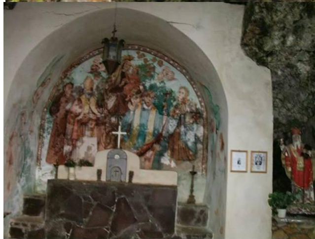
Inside the Cave of San Biagio Cp357